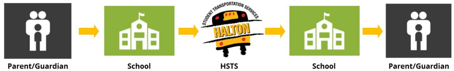
Information Flow between parent/guardian, the school and Halton Student Transportation Services

* Please note, during regular school months HSTS can only accept address changes from the school.